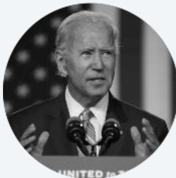
Biden criticizes violence while