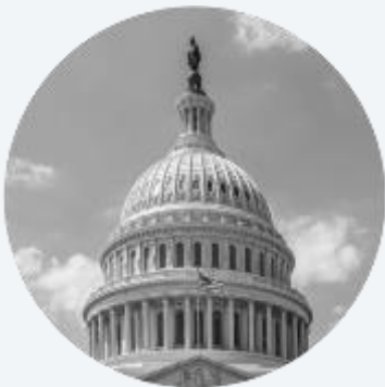
Buchanan and Good launch first 2020