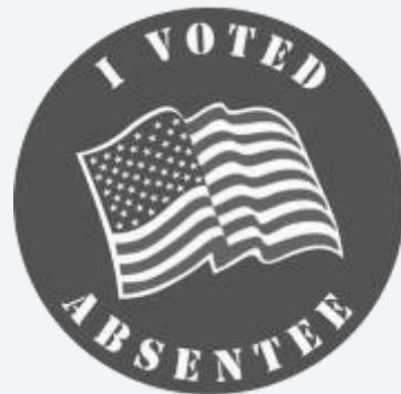
Washington Post slammed for claiming