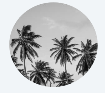
Florida didn't get the Republican