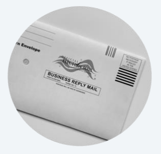
Postmaster says mailin ballots No. 1 priority, but details no plan